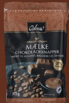
ODENSE Milk Chocolate Chips, 37%, 115g