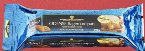
ODENSE Baking Marzipan, 300g