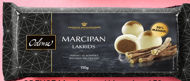
ODENSE Marzipan w/ Licorice, 150g