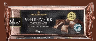
ODENSE Milk Chocolate 39%, 150g