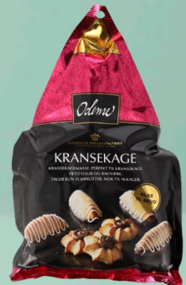
ODENSE 'Kransekage' Baking Paste, 400g