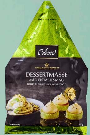
ODENSE Dessert Paste w/ Pistachio- flavour, 200g

Developed for convenience, the products are ready to use straight from the packaging, making them perfect for both everyday baking and special occasions. Simply pipe, spread or shape to achieve professional-looking results with minimal effort.