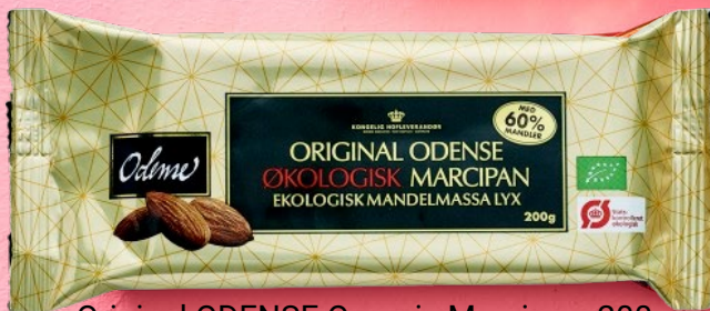
Original ODENSE Organic Marzipan, 200g