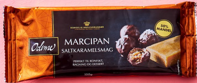
ODENSE Marzipan w/ Salty Caramel, 150g

Flavoured varieties such as cherry and salty caramel bring a modern twist, while organic marzipan offers a pure almond taste made with the same focus on quality and craftsmanship.