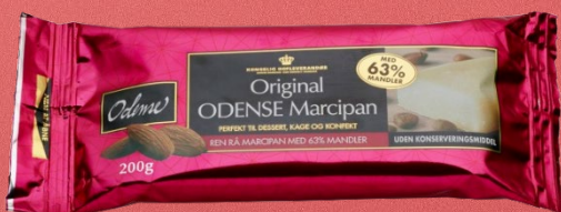
Original ODENSE Marcipan, 200g