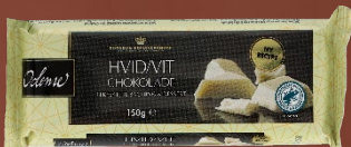
ODENSE White Chocolate, 150g