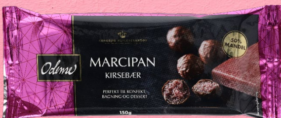
ODENSE Marzipan w/ Cherry, 150g

In addition to the existing range, we continuously work on developing new flavours and can tailor-make flavour variants to meet specific preferences and trends.