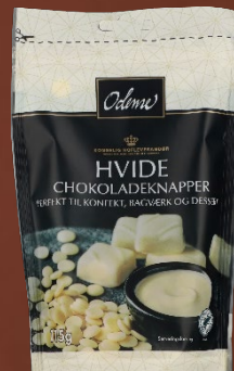
ODENSE White Chocolate Chips, 115g