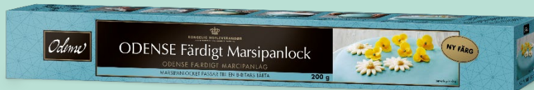
Ready-Rolled Marzipan, Blue, 200g