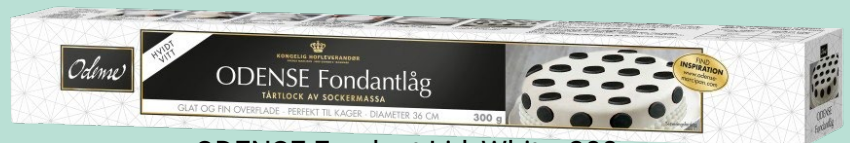
ODENSE Fondant Lid, White, 300g

Discover a selection of the colours below: