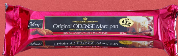
Original ODENSE Marcipan, 375g