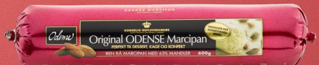
Original ODENSE Marcipan, 900g