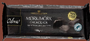
ODENSE Dark Chocolate 70%, 150g

ODENSE chocolate chips are easy to work with and deliver consistent results. Their rich and intense chocolate flavour makes them a versatile ingredient for a wide range of recipes and serving occasions throughout the day.