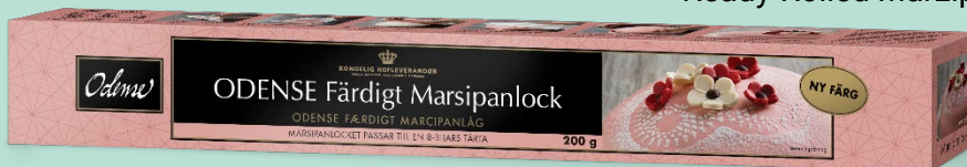
Ready-Rolled Marzipan, Pink, 200g