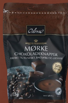
ODENSE Dark Chocolate Chips 54%, 115g