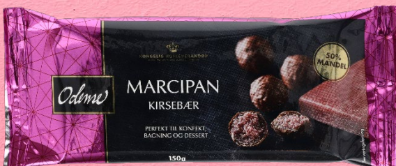
ODENSE Marzipan w/ Cherry, 150g

In addition to the existing range, we continuously work on developing new flavours and can tailor-make flavour variants to meet specific preferences and trends.