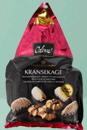
ODENSE 'Kransekage' Baking Paste, 400g