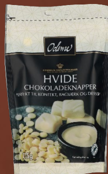
ODENSE White Chocolate Chips, 115g