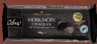
ODENSE Dark Chocolate 70%, 150g

ODENSE chocolate chips are easy to work with and deliver consistent results. Their rich and intense chocolate flavour makes them a versatile ingredient for a wide range of recipes and serving occasions throughout the day.