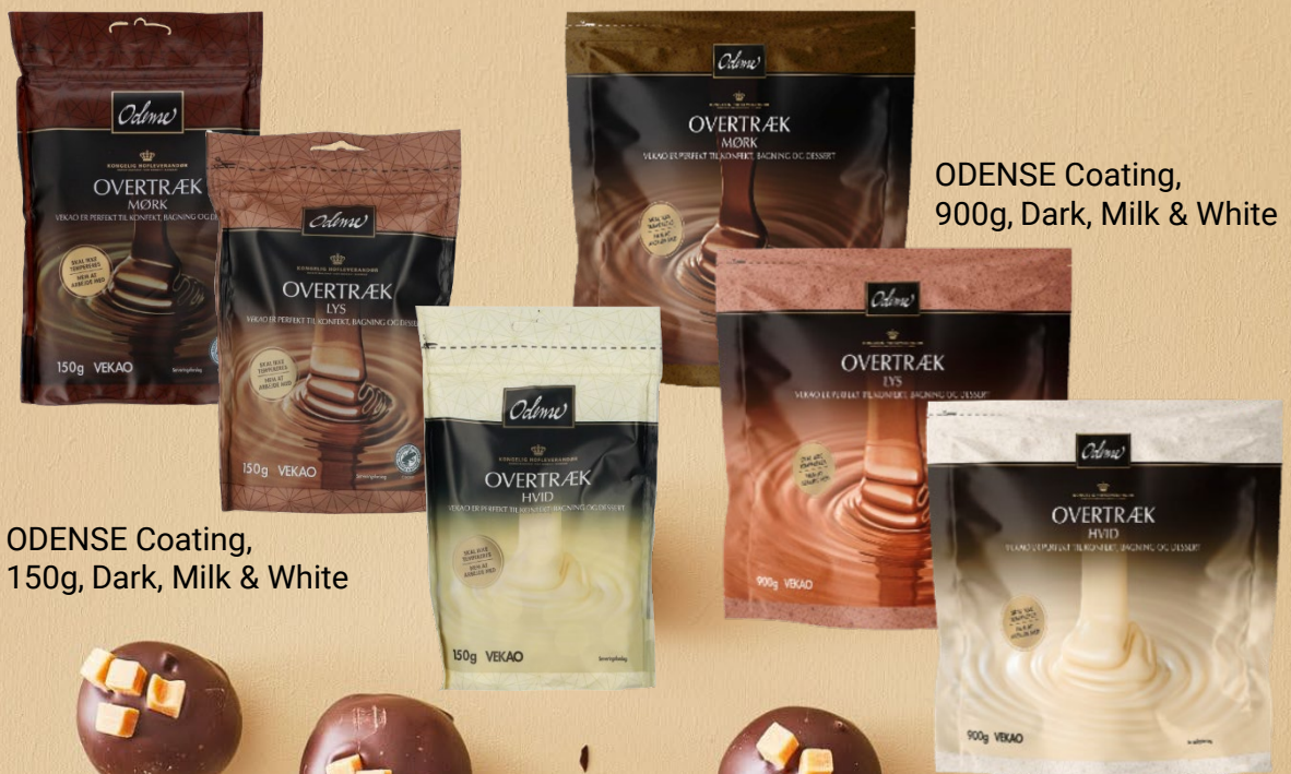
ODENSE Coating, 900g, Dark, Milk & White

Ideal for cakes and desserts, confectionery, decorative drizzles, or as a coating for nuts, fresh or dried fruits, cream puffs and more.