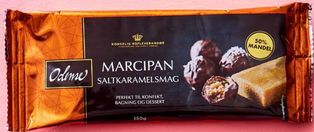
ODENSE Marzipan w/ Salty Caramel, 150g

Flavoured varieties such as cherry and salty caramel bring a modern twist, while organic marzipan offers a pure almond taste made with the same focus on quality and craftsmanship.