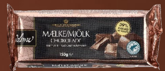
ODENSE Milk Chocolate 39%, 150g