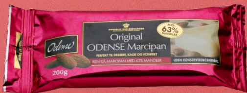
Original ODENSE Marcipan, 200g