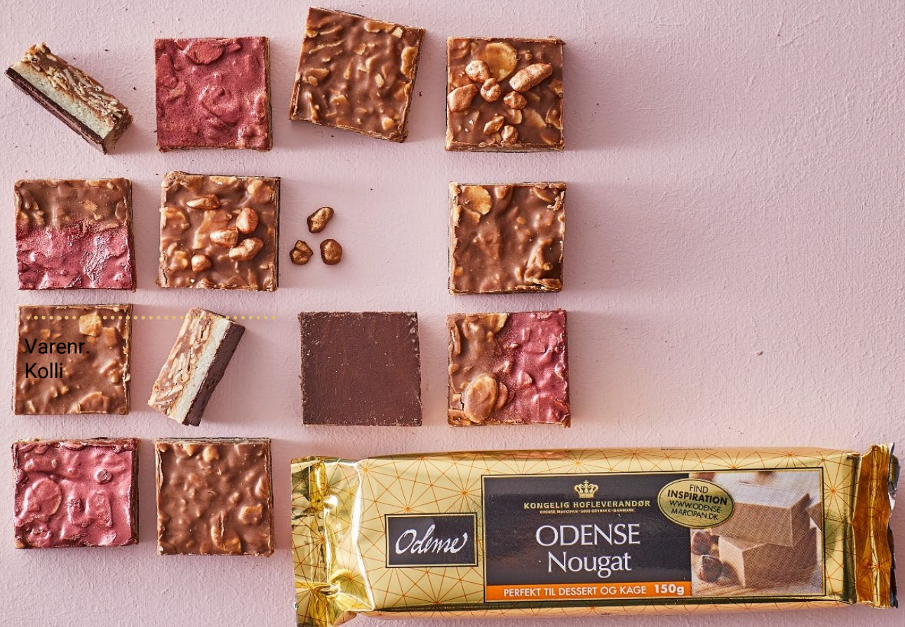
ODENSE Nougat, 150g

With consistent quality and many usage possibilities, ODENSE hazelnut products make it easy to create indulgent confectionery and desserts with a refined nutty taste.