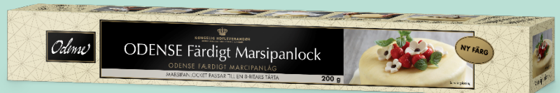
Ready-Rolled Marzipan, Neutral, 200g