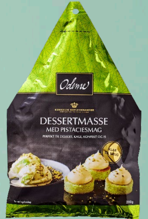
ODENSE Dessert Paste w/ Pistachio- flavour, 200g

Developed for convenience, the products are ready to use straight from the packaging, making them perfect for both everyday baking and special occasions. Simply pipe, spread or shape to achieve professional-looking results with minimal effort.