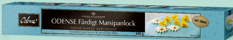
Ready-Rolled Marzipan, Blue, 200g