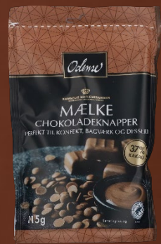
ODENSE Milk Chocolate Chips, 37%, 115g