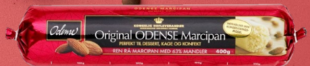
Original ODENSE Marcipan, 400g