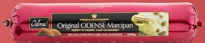
Original ODENSE Marcipan, 900g