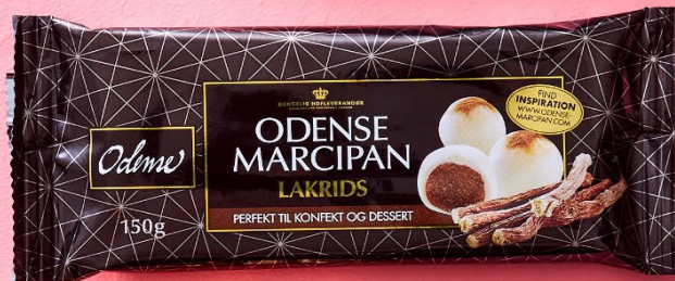
ODENSE Marzipan w/ Liquorice, 150g