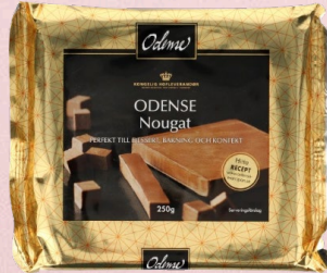
ODENSE Nougat, 250g