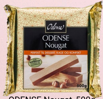
ODENSE Nougat, 500g