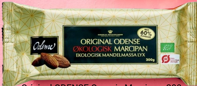
Original ODENSE Organic Marzipan, 200g

In addition to the existing range, we continuously work on developing new flavours and can tailor-make flavour variants to meet specific preferences and trends.