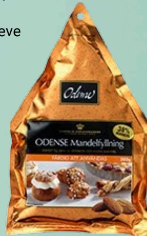
ODENSE Almond Filling, 200g