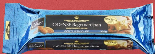
ODENSE Baking Marzipan, 300g