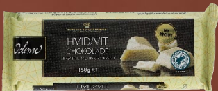
ODENSE White Chocolate, 150g