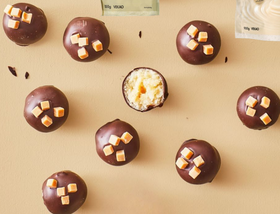
ODENSE Coating, 150g, Dark, Milk & White