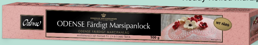
Ready-Rolled Marzipan, Pink, 200g