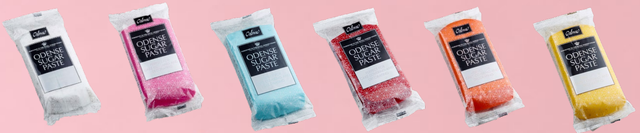
ODENSE Sugar Paste, 150g

The different colours can be used as they are or mixed to create your own unique shades. Or custom shades can be made for you.