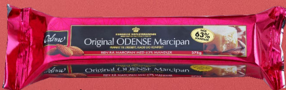
Original ODENSE Marcipan, 375g