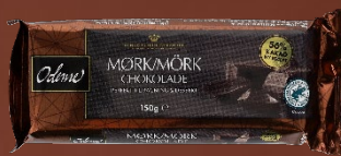
ODENSE Dark Chocolate 56%, 150g