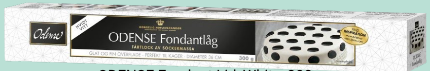
ODENSE Fondant Lid, White, 300g

Discover a selection of the colours below: